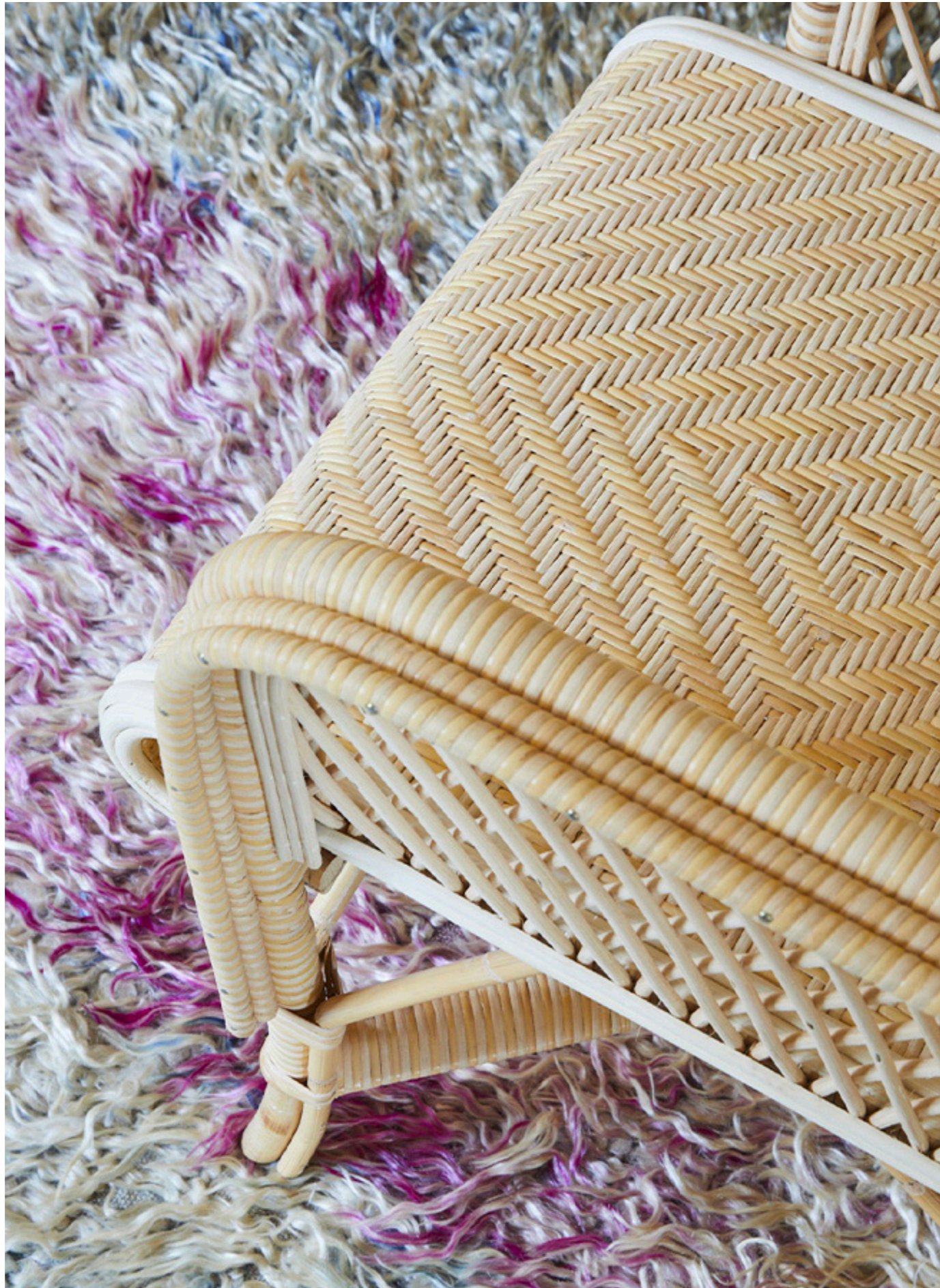
The Cabinet-maker angle