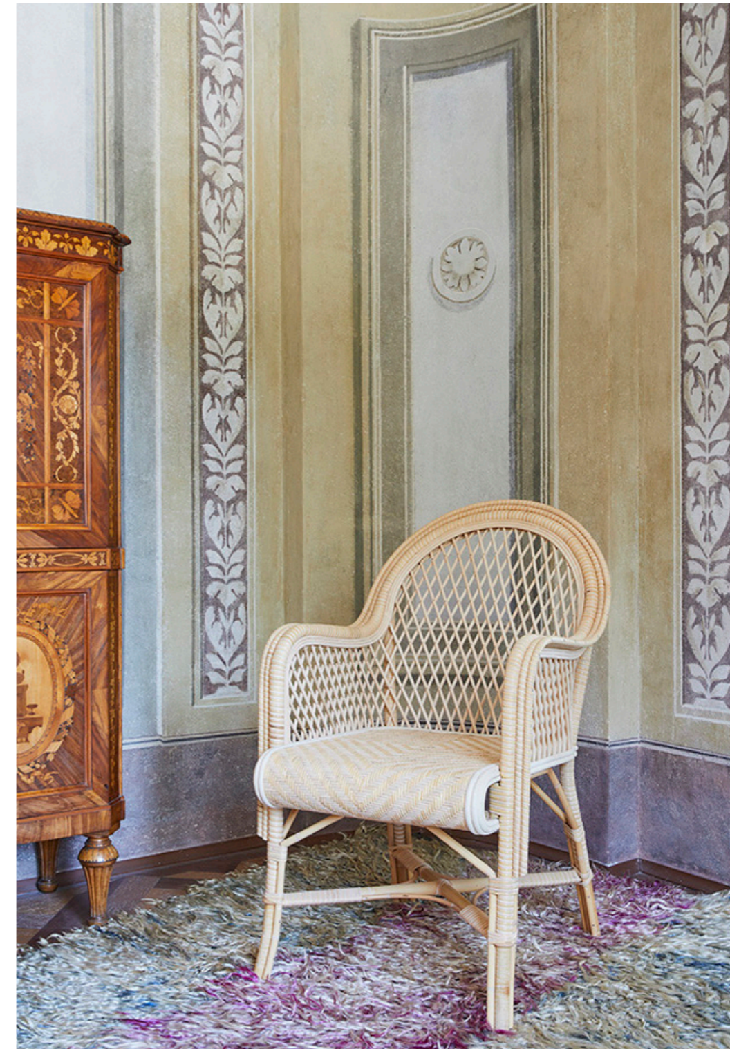
Starring Brando Bi color dining chair Design by Mario Bonacina and Renzo Mongiardino

with Altai rug Filikli Anatolia - Karapinar Early 20th Century Angora Wool