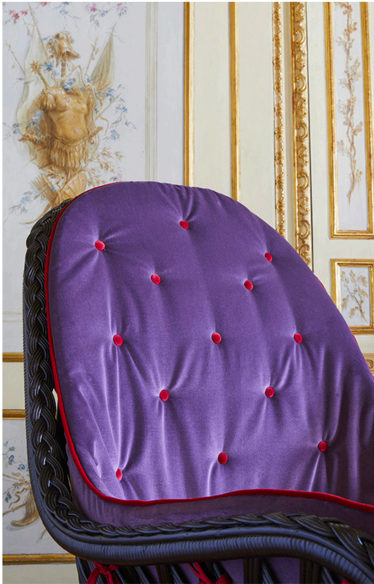
Sala del duca di Chiablese (The Duke of Chiablese's room)

Hues such as deep red and violet, historically royal colours, symbols of power, fire and victory, find their place among scenes of ancient history, in an atmosphere of Rocaille taste, a decoration made with stones, rocks and shells.