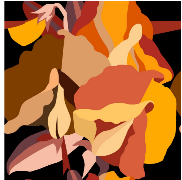
Desert Macro Indoor/Outdoor Textile Oil/Water stain resistant finish UV resistant finish ISO105 B04 - 6/7