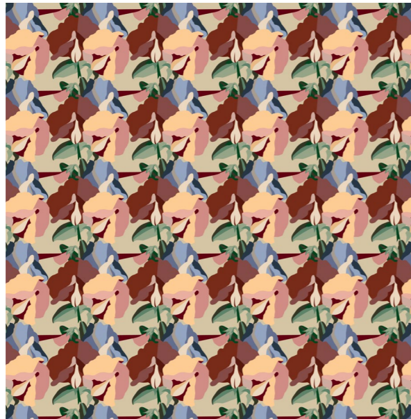
Pastel Micro Indoor/Outdoor Textile Oil/Water stain resistant finish UV resistant finish ISO105 B04 - 6/7