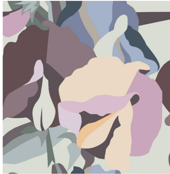
Pastel Faded Macro Indoor/Outdoor Textile Oil/Water stain resistant finish UV resistant finish ISO105 B04 - 6/7