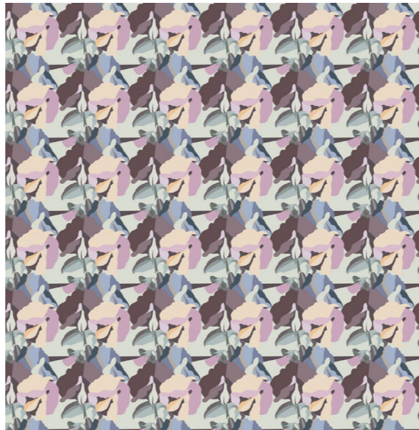
Pastel Faded Micro Indoor/Outdoor Textile Oil/Water stain resistant finish UV resistant finish ISO105 B04 - 6/7