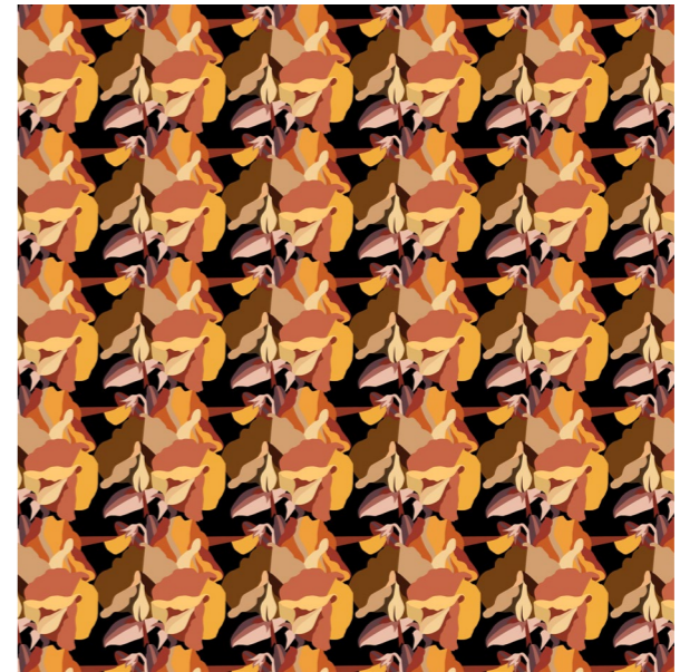
Desert Micro Indoor/Outdoor Textile Oil/Water stain resistant finish UV resistant finish ISO105 B04 - 6/7