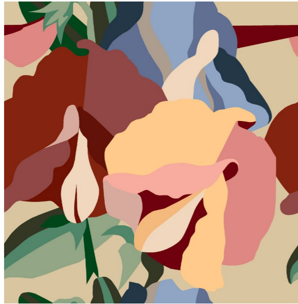
Pastel Macro Indoor/Outdoor Textile Oil/Water stain resistant finish UV resistant finish ISO105 B04 - 6/7